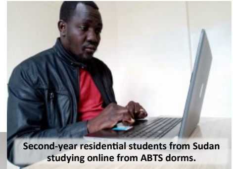
Second-year residential students from Sudan studying online from ABTS dorms.

We praise God for allowing our residential students to meet again as a community through the online platforms. We pray that both, our students and our faculty members, cope well with this migration! We know God has already been preparing us for today, and He will certainly teach us to do things differently as we continue to partake in His mission. The work is plentiful in the region, even more so now. As the world comes out of this pandemic, it will be facing challenges of a new order. This makes the role of our churches, and consequently the leaders we are training, even more crucial.